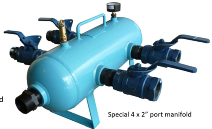
Special 4 x 2" port manifold